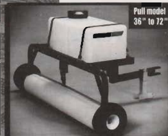
Pull model 36" to 72"