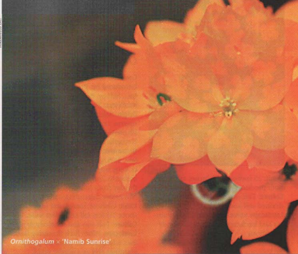
Ornithogalum × 'Namib Sunrise'