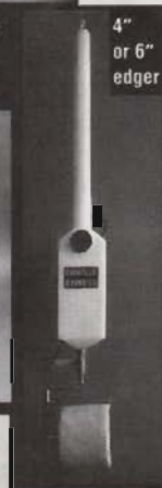
4" or 6" edger