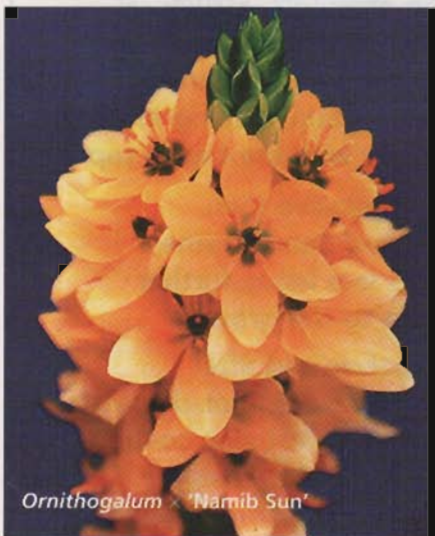
Ornithogalum × 'Namib Sun'