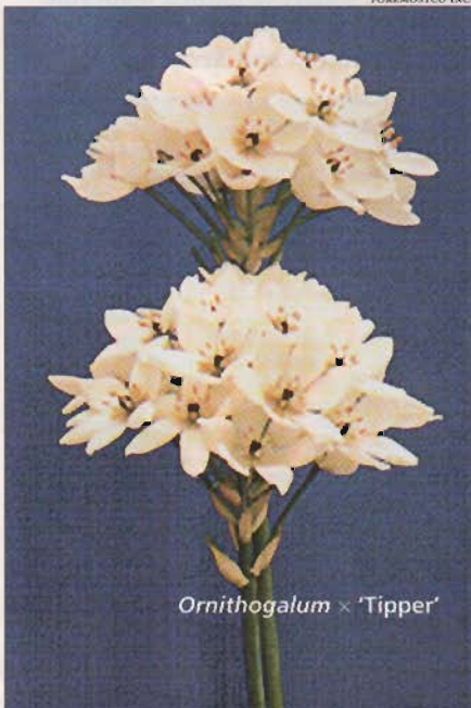
Ornithogalum × 'Tipper'