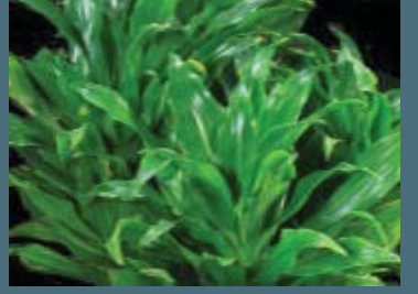
Dracaena JC Compacta